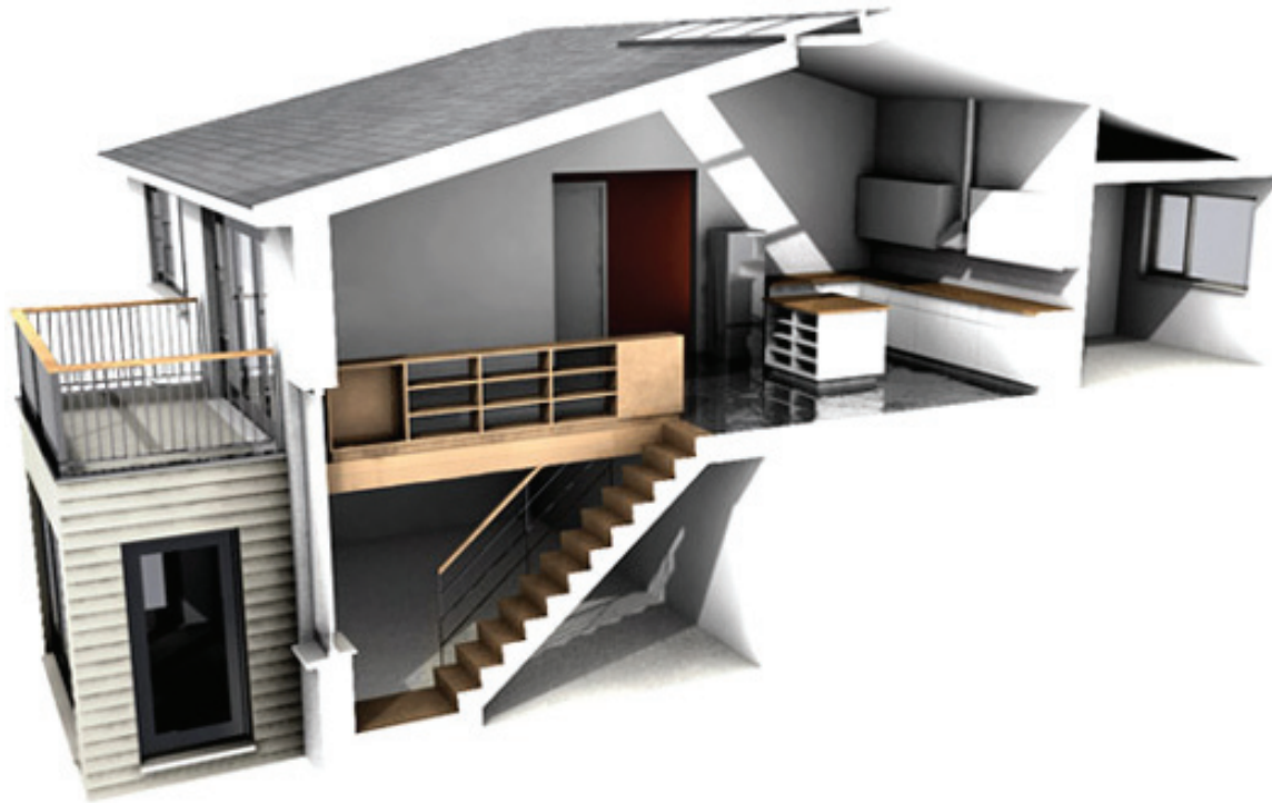
Computer Rendered Sectional Perspective (above); Computer Rendered Perspective of the main living area (above right).