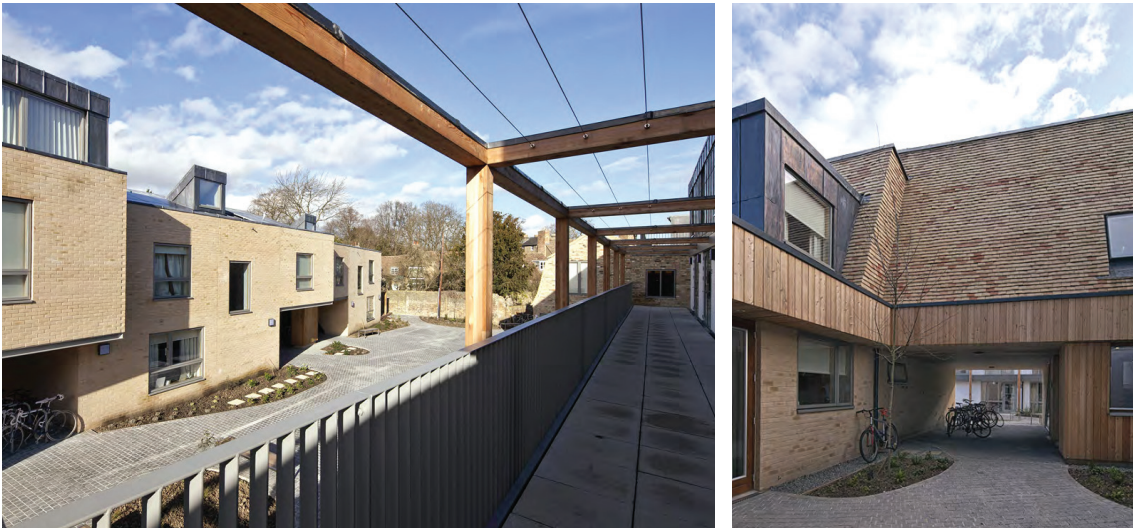
Photographs on completion (above); Proposal 'in context' - Images submitted for planning (right).

Completed in 2013, this 4.5 million 32 unit housing development is set within a Conservation Area in Newnham Village, Cambridge. It comprised the remodelling of the existing terrace, the restoration of a listed shop unit and the addition of a new building behind to frame a mews-like courtyard.